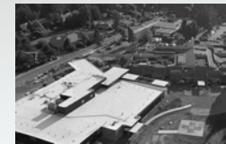
Aerial view shows proximity of new hospital, bottom left, to the 1968 hospital, center right.

Construction takes just 17 months to complete.