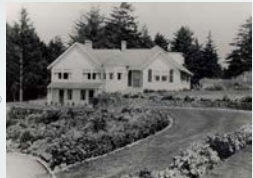
A small hospital is established inside the former Iro N Ranch in Wecoma.

The community of Wecoma is home, once again, to a new North Lincoln Hospital, located in a former residence. Again, it is unknown how long this facility operates.